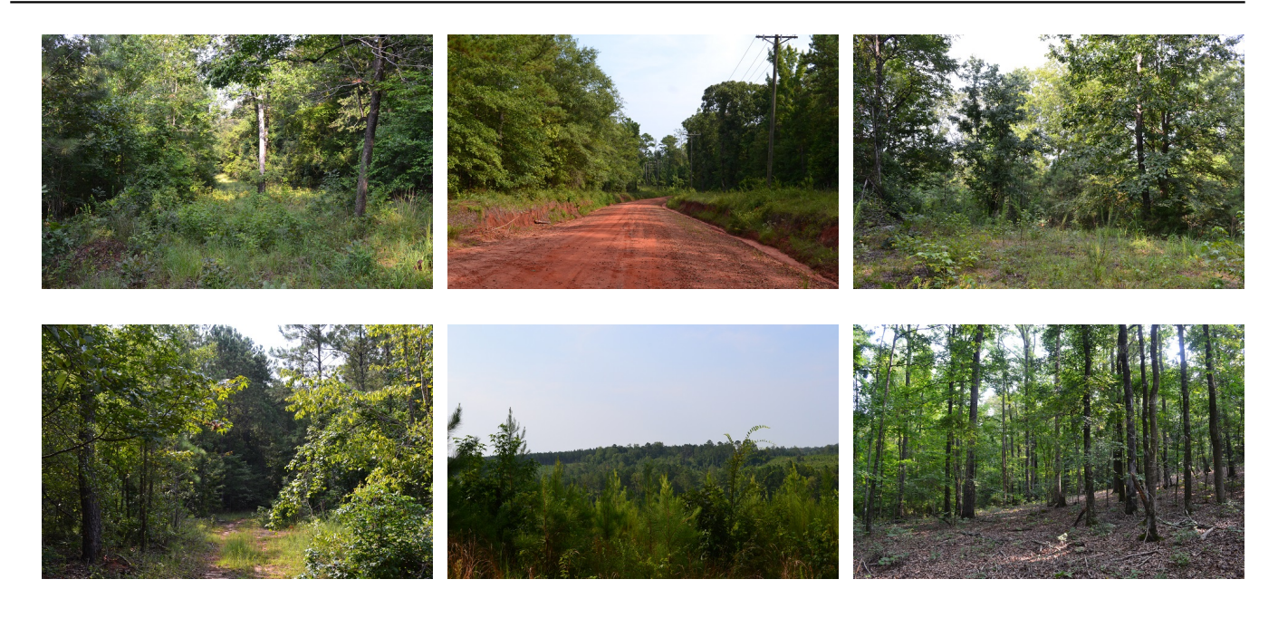
Big Branch Published on Plantation Properties & Land Investments, LLC (https://landandrivers.com)