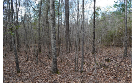
Durham Mill Road Twiggs County, Georgia, 5.21 AC +/-