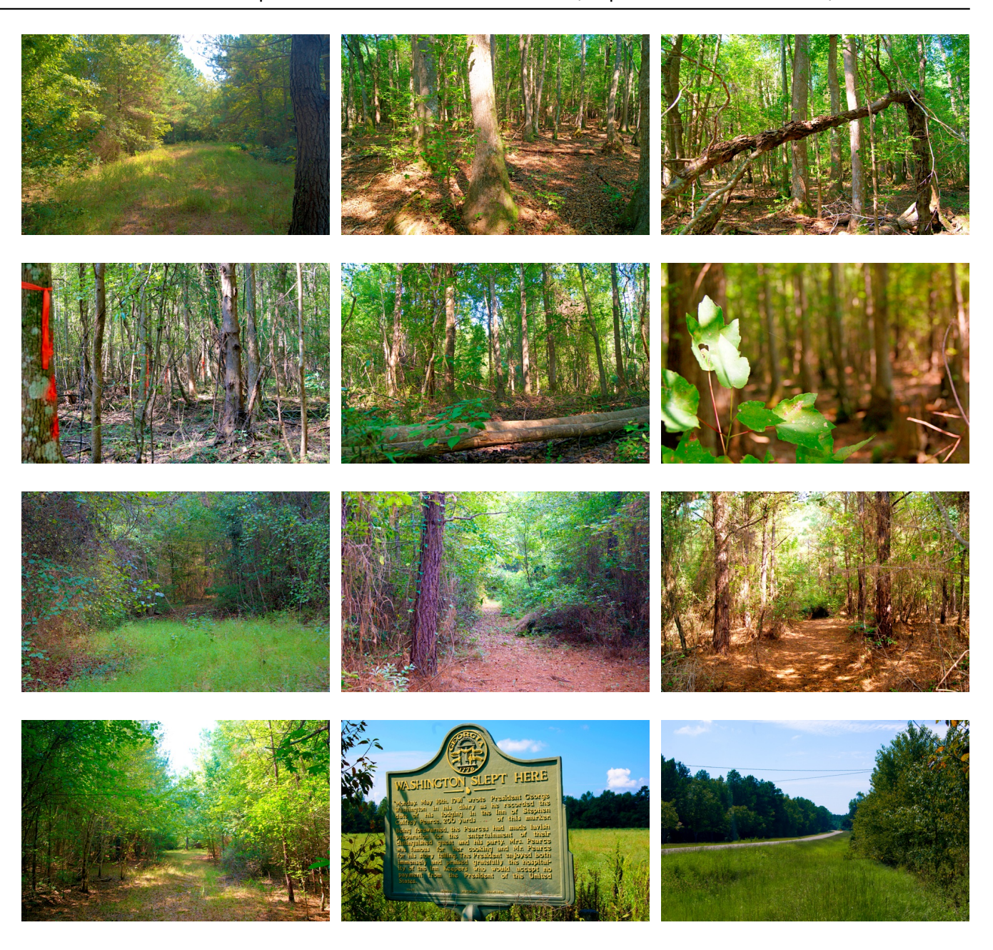
Source URL: <a href="https://landandrivers.com/property/washington-camp-tract">https://landandrivers.com/property/washington-camp-tract</a>