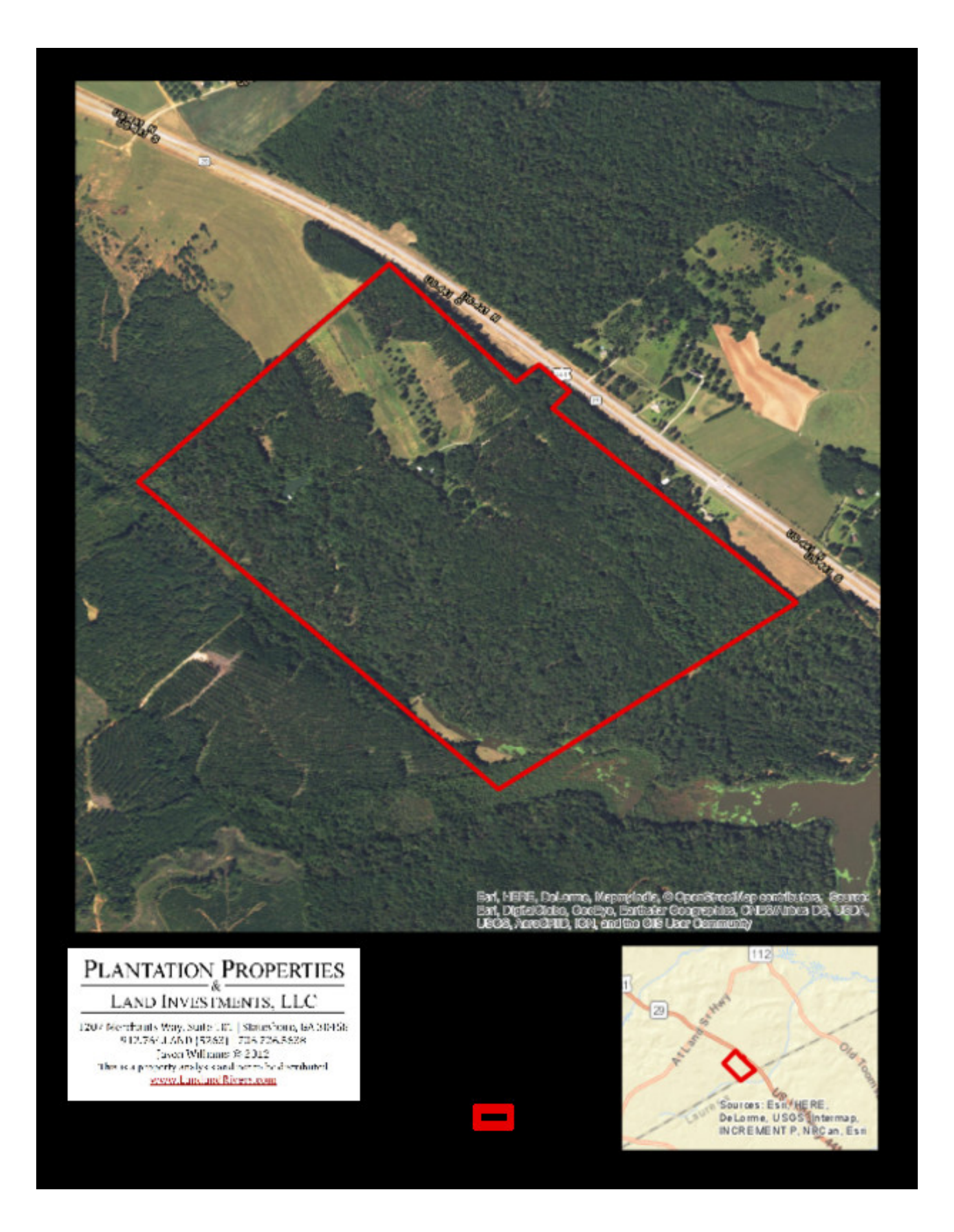
Source URL: <a href="https://landandrivers.com/property/hall-plantation">https://landandrivers.com/property/hall-plantation</a>